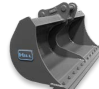
DITCH CLEANING OR GRADING BUCKETS

Our range is available in widths from 72” up to 120”. All sizes feature a central strengthening rib and can have a welded cutting edge or a bolt on reversible type. These buckets have been carefully designed to provide long service life in the full range of site and ground conditions.